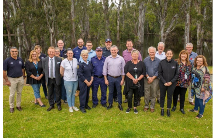
Council staff and emergency service personnel met with Minister for Emergency Management Murray Watt.