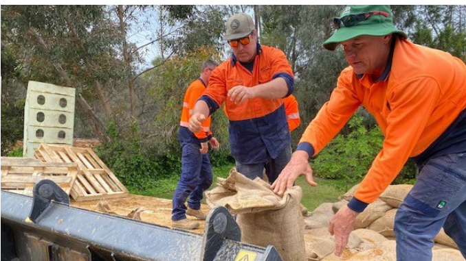
Members of Council's Works and Parks and Gardens teams, along with volunteers, sandbagging houses in Echuca.