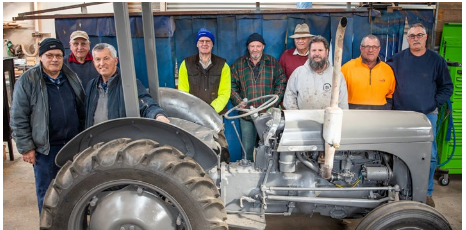
The Stanhope Men's Shed members with the 1948 Massey Ferguson tractor they are restoring.