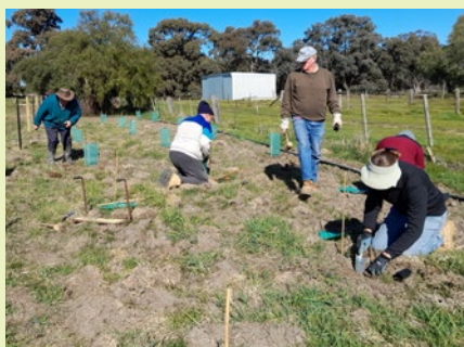
A working bee to plant the 100 seedlings in July, with help from Koyuga-Kanyapella Landcare Group.