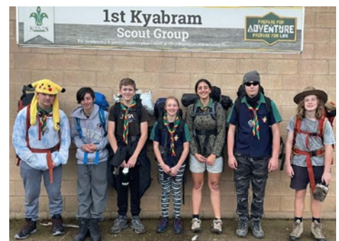
The 1st Kyabram Scouts took part in a state wide hiking event at Tallarook State Forest in May.