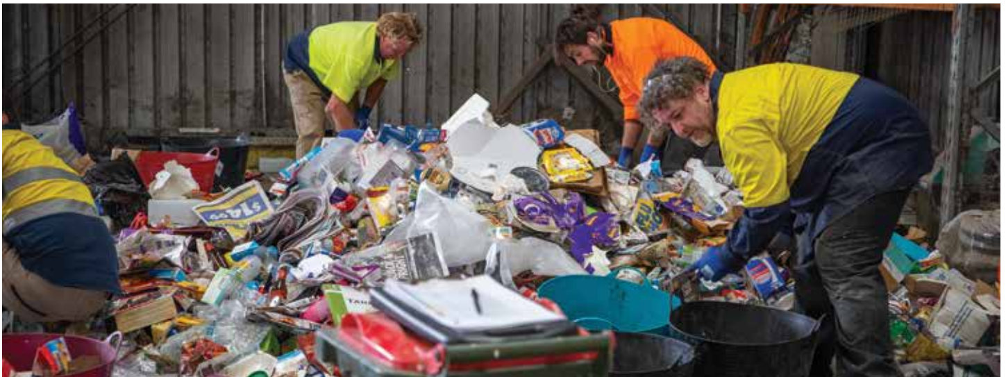
A sample of 209 waste bins (red lid), 209 recycle bins (yellow lid) and 209 food and garden bins (green lid) were audited by Just Waste Consulting in May this year.

The audit was commissioned by the Goulburn Valley Waste and Resource Recovery Group (GVWRRG) of which Campaspe Shire is a member, together with five other partner councils, Greater Shepparton, Mitchell, Moira, Murrindindi and Strathbogie. Kerbside bin audits are completed around every five years and provide valuable data to councils to allow them to make changes when needed to kerbside collections. The data is also used for educational purposes, such as decreasing the contamination level in recycling bins.