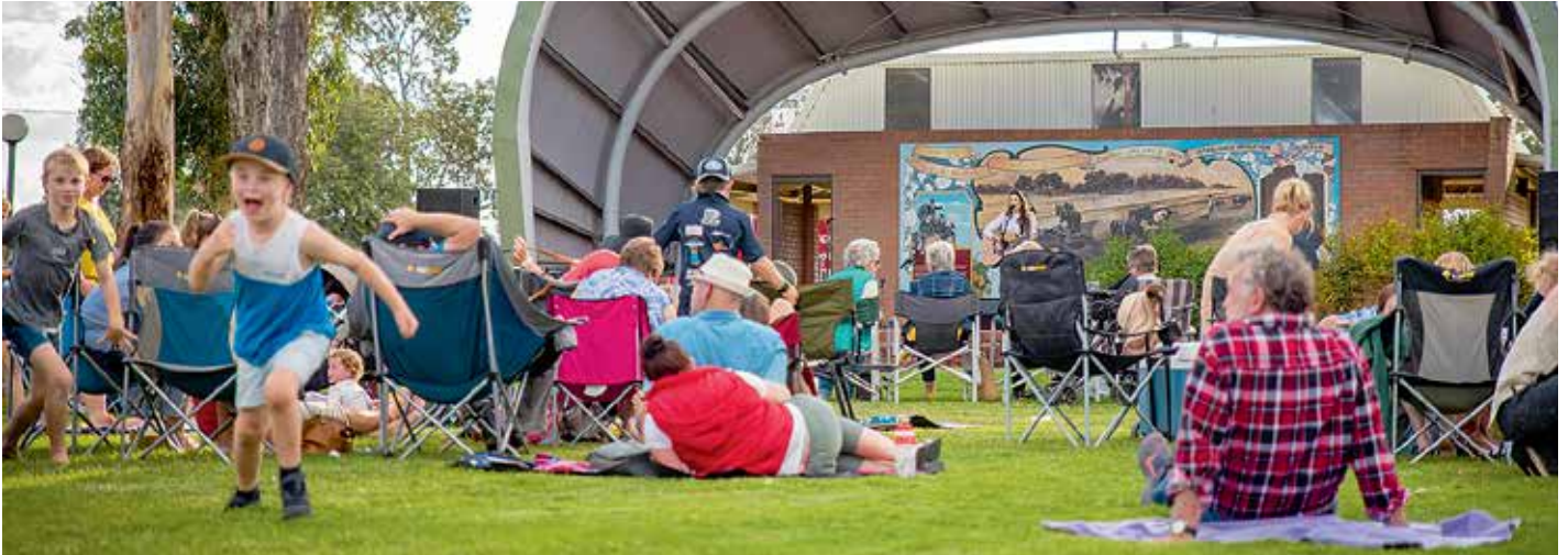
The Tongala Eats and Beats community event was successful in a grant to support their inaugural event.