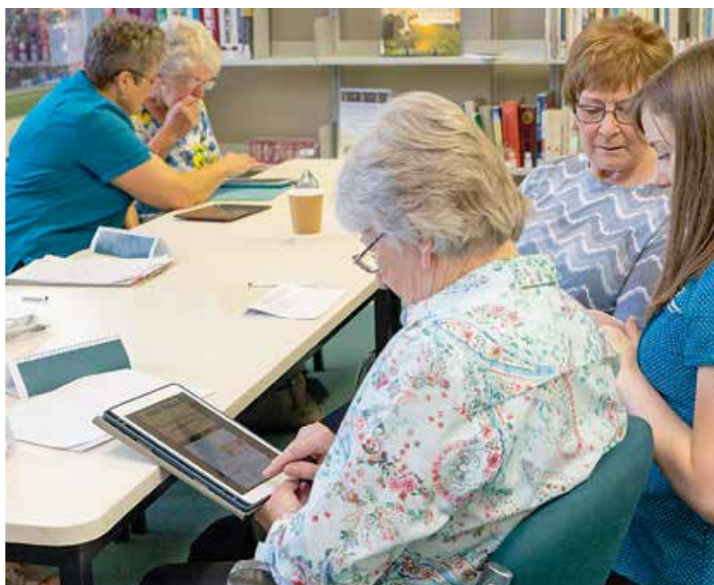
A Tech Help session at the Kyabram Library.

There is no requirement to book or attend weekly – just attend what suits your interest.