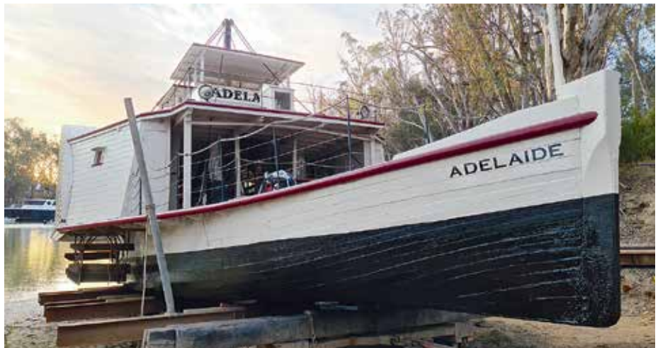
PS Adelaide on the Moama Slipway, ready to be relaunched after works completed.

The out-of-water inspection and maintenance works occur at the Moama Slipway, the only facility in the region. Because of the age of the boats, traditional tradespeople who use specialist materials, are used to