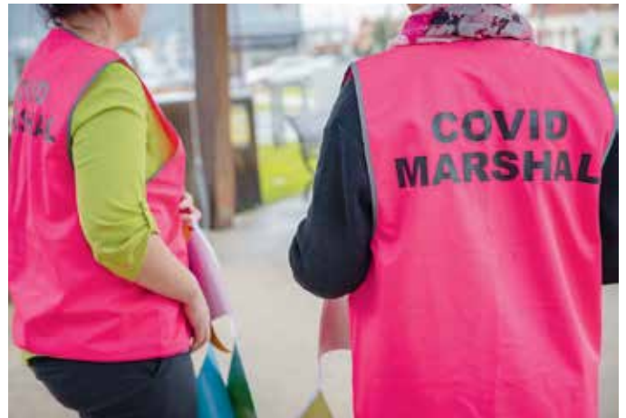
COVID marshal vests are just one piece of equipment now available to support event coordinators.

complete a simple online form (available at www.campaspe.vic.gov.au/events ) providing their event details and equipment selections. Council's Events Support Officer will then be in touch to discuss arrangements.