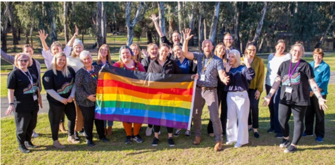
In May, Council hosted representatives from multiple local organisations including health services, disability services and schools gather to look at ways to make their services more welcoming and inclusive of LGBTIQ+ people.