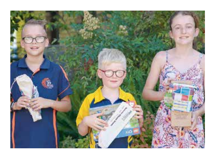
Remember "know your recycling – because what you do makes a difference". For more information on recycling please visit Council's website.