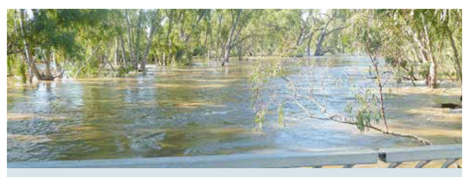
The Campaspe River in flood at Rochester in 2011.

Rochester SES Unit Controller, Judith Gledhill checking one of the local flood markers.