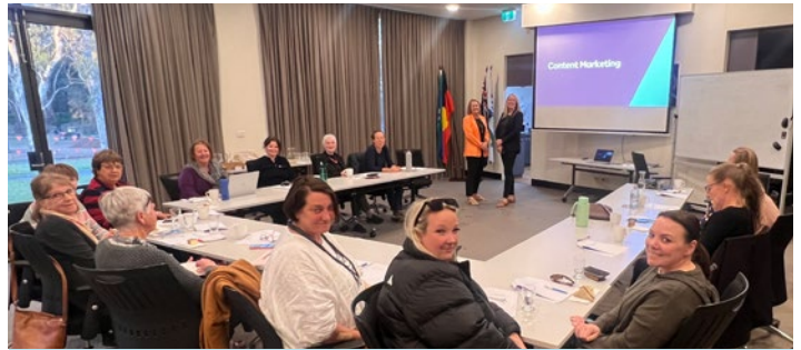
Council hosted a Social Media and Content Marketing Workshop run by Business Victoria attended by local business owners, community volunteers and staff from local organisations to learn more about utilising social media.