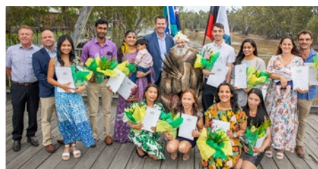
Congratulations to our 12 new Australian citizens of Campaspe Shire who were conferred on 25 January.