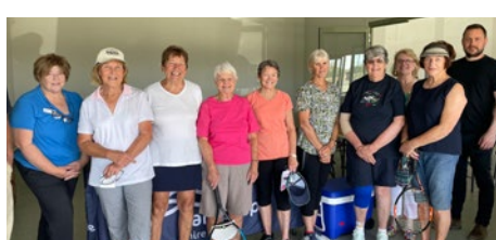
Council's Recovery Team hosted a pop-up information session at Echuca Village Hall to help connect flood affected residents connect with services they need.