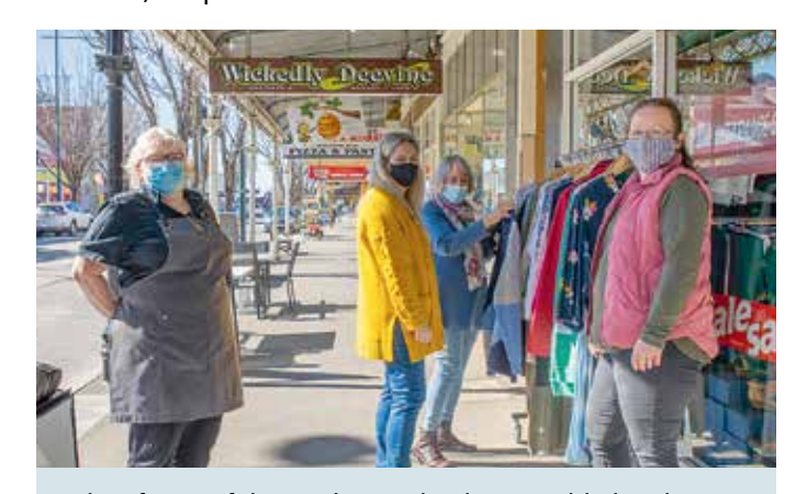
A key focus of the Kyabram plan is to enable local businesses to survive and thrive, with a number of projects identified.

This vision statement is at the heart of the Kyabram Place Based Plan, a four-year plan outlining key priorities of the community to make their town even more liveable, inclusive, adaptable and resilient.