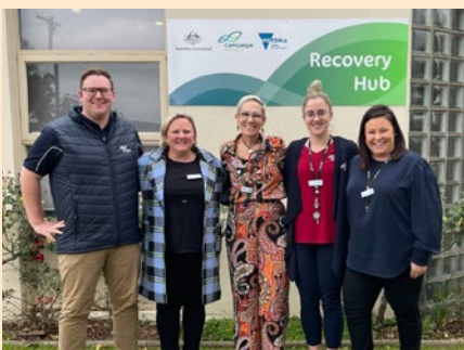
Council's flood recovery staff at the new Rochester facility.

Campaspe Shire's new Flood Recovery Hub located at 48 Mackay Street in Rochester is the primary place to access support and resources. Council's dedicated Flood Recovery team operates from the hub Monday to Friday from 8.30am-5pm. The hub is also home to a range of government and professional agencies, including Anglicare, Partners in Wellbeing, Department of Families, Fairness and Housing, MIND Australia, Echuca Regional Health case management and Bendigo Community Health case management. To download a Recovery Hub services guide, visit www.campaspe.vic.gov.au/recovery and click on 'Recovery Hub'.