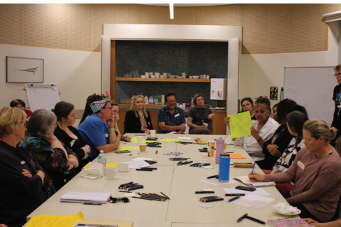
The inaugural meeting of the Creative Co-Design Group was held in October at the Echuca library, where Council's Arts & Culture team began the process of collaborating with community members to organise an arts festival to be held in 2025.