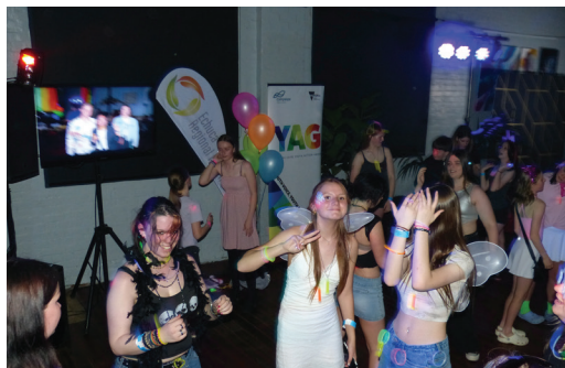
Council's Youth Development Team collaborated with Echuca Regional Health, headspace and Thorne Harbour Health to host the Youth Glow Up Disco attended by over 80 young people from around the shire who had a fantastic time dancing the night away.