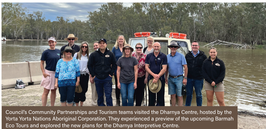
Council's Community Partnerships and Tourism teams visited the Dharnya Centre, hosted by the Yorta Yorta Nations Aboriginal Corporation. They experienced a preview of the upcoming Barmah Eco Tours and explored the new plans for the Dharnya Interpretive Centre.