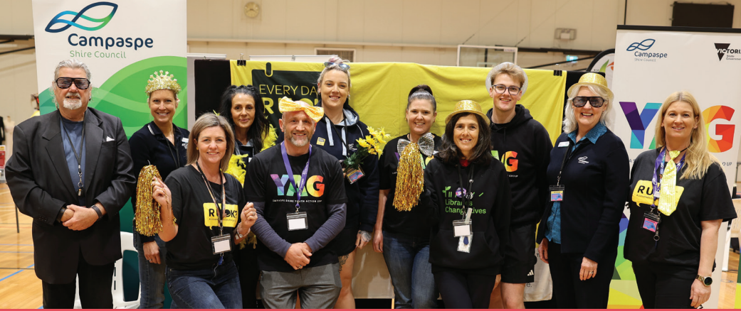
Council Officers assisted with the organisation and attended the Campaspe Youth Expo at the Echuca Stadium in September.