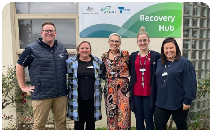
Council's new Recovery Team working from Campaspe Shire's new Recovery Hub in Rochester.

To contact the Recovery Hub, please call 1300 666 535 and press 2 or email shire@campaspe.vic.gov.au .