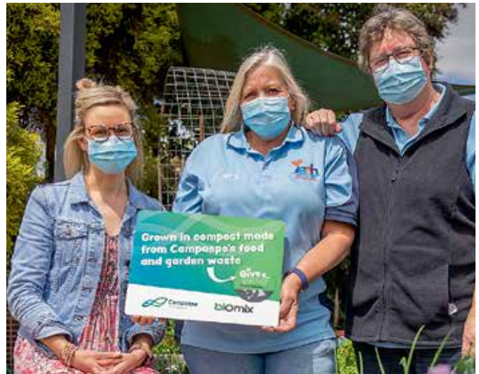
Echuca Neighbourhood House