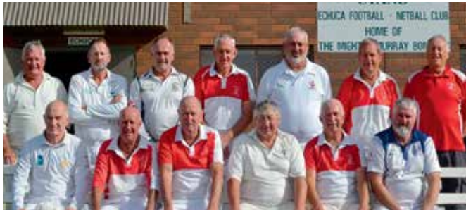
Reigning Division One Premiers, Vic Country.

Veteran's cricket is a spectator sport like no other. It produces thrilling matches jam-packed with Phils, spills and plenty of drink refills – to summarise, it's the most fun you'll have in one afternoon. The 9th Annual Over 60's Cricket Carnival is no exception, with participation numbers soaring. In their inaugural year, just four teams entered the carnival. This year, 24 Victorian teams and four interstate teams will converge to smack 'em for six at cricket grounds