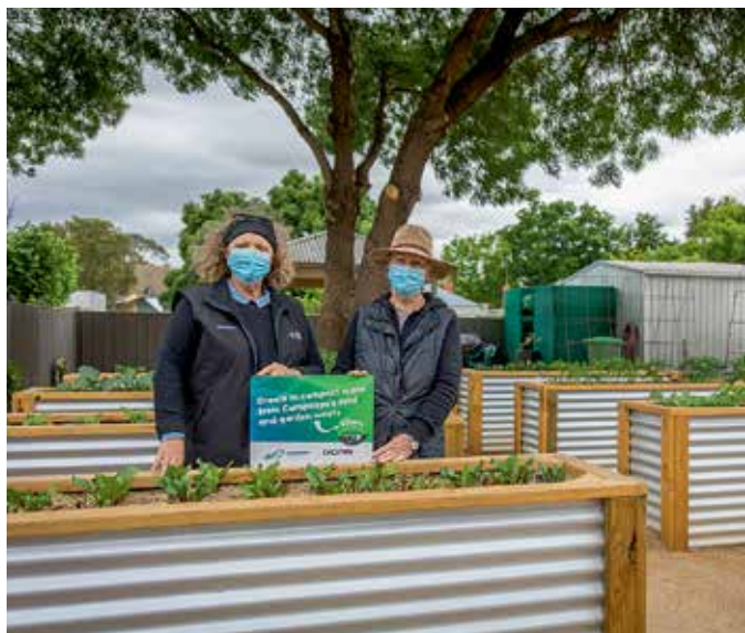
Girgarre Community Cottage

Compost was used to rejuvenate their six vegetable plots.