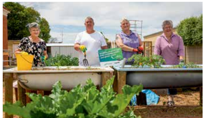
Rochester Community Garden