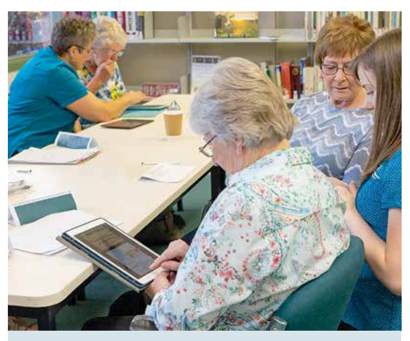
A Tech Help session at the Kyabram Library.

There is no requirement to book or attend weekly – just attend what suits your interest.