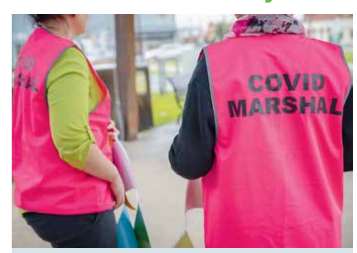
COVID marshal vests are just one piece of equipment now available to support event coordinators.

complete a simple online form (available at www.campaspe.vic.gov.au/events providing their event details and equipment selections. Council's Events Support Officer will then be in touch to discuss arrangements.