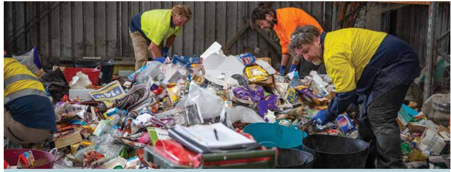
A sample of 209 waste bins (red lid), 209 recycle bins (yellow lid) and 209 food and garden bins (green lid) were audited by Just Waste Consulting in May this year.

The audit was commissioned by the Goulburn Valley Waste and Resource Recovery Group (GVWRRG) of which Campaspe Shire is a member, together with five other partner councils, Greater Shepparton, Mitchell, Moira, Murrindindi and Strathbogie. Kerbside bin audits are completed around every five years and provide valuable data to councils to allow them to make changes when needed to kerbside collections. The data is also used for educational purposes, such as decreasing the contamination level in recycling bins.