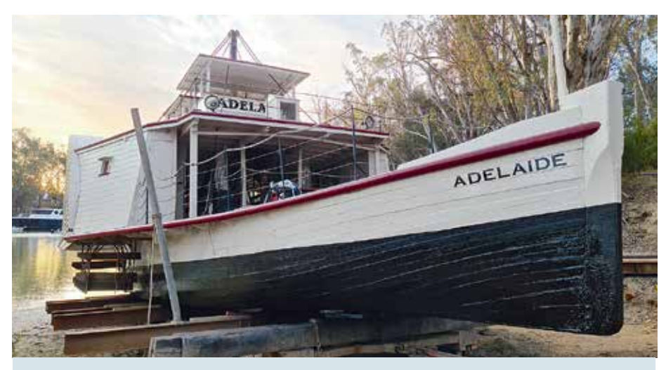
PS Adelaide on the Moama Slipway, ready to be relaunched after works completed.

The out-of-water inspection and maintenance works occur at the Moama Slipway, the only facility in the region. Because of the age of the boats, traditional tradespeople who use specialist materials, are used to