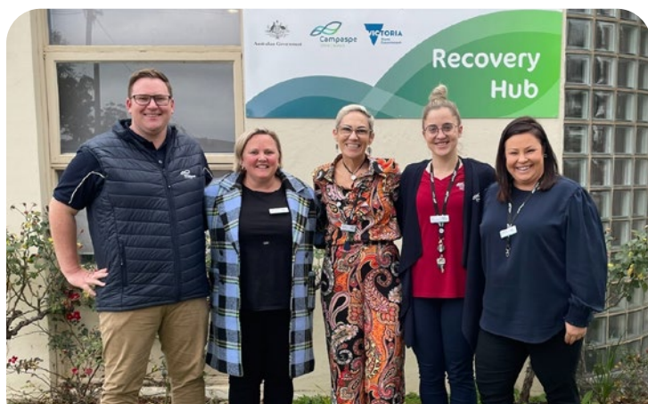
Council's new Recovery Team working from Campaspe Shire's new Recovery Hub in Rochester.

To contact the Recovery Hub, please call 1300 666 535 and press 2 or email shire@campaspe.vic.gov.au .