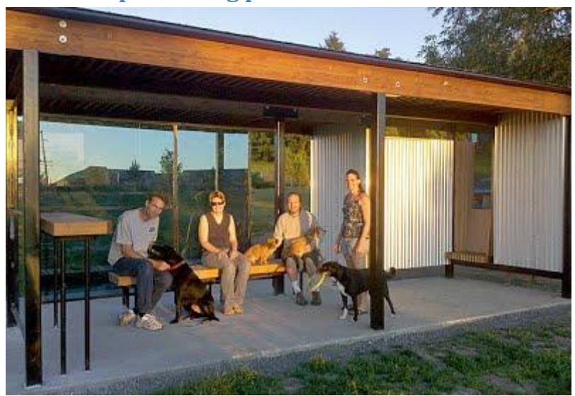
Figure 1: Dog Park Weather Shelter in Moscow, USA