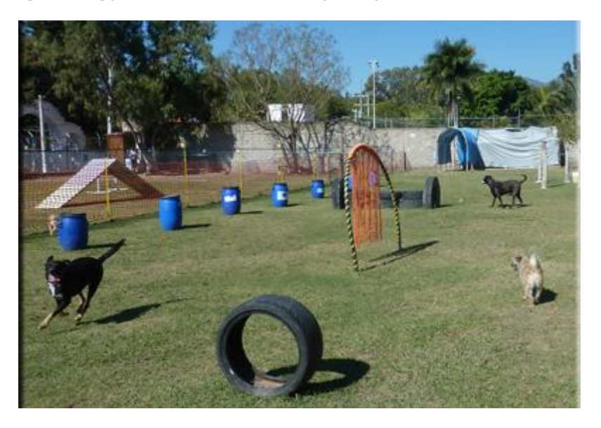
Figure 3: Agility equipment at Free Spirit Dog Park in San Antonio Tlay, Mexico