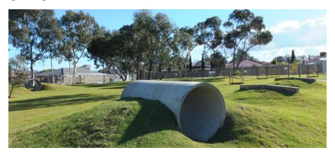
Figure 2: Dog park mounds and tunnel in City of Playford, South Australia