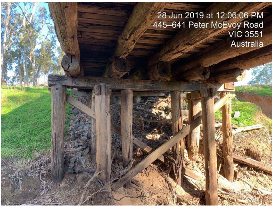
In 2018, Council commenced consultation on the future of McEvoys Bridge with the support of engineering firm RPS. Feedback from the community from face to face, email and phone contact was that landowners required general access to continue sheep/cropping operations. It was noted that Landowners that owned blocks on either side of the bridge have historically operated them as contiguous properties.

Face to face landowner consultation was again undertaken by Council staff in January 2020 after analysis of the available options. Council staff met individually with all surrounding landowners and a representative of CLAPIC (Cornella Local Area Planning Implementation Committee) to discuss the options for the bridge. All