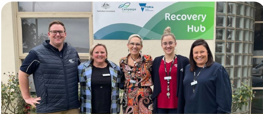
Council's new Recovery Team working from Campaspe Shire's new Recovery Hub in Rochester.

Funded by the Victorian Government through Emergency Recovery Victoria, the hub will be the primary location for people to access the services and support they need to recover from the flood. A mobile outreach unit will also enable the staff to visit people in the community through pop-up sessions, events and specialised programs. A range of forums and programs designed to equip residents with knowledge and skills on emergency preparedness and resilience will also run from the hub.